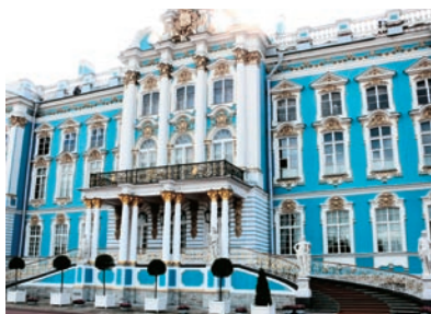
Catherine's Palace and Grand Ballroom.

Day Two saw us following two lovely young Russian guides through St Petersburg's stunning Hermitage Museum. It's one of the oldest and largest art muse-